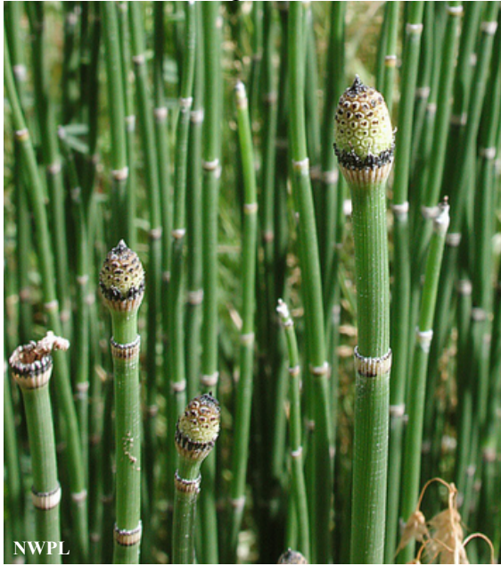
Equisetum laevigatum Smooth Scouring-Rush (FAC)