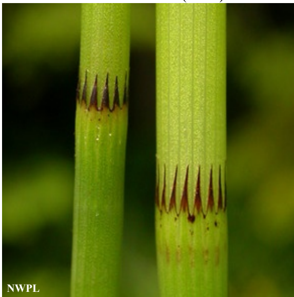
Equisetum fluviatile Water Horsetail (OBL)